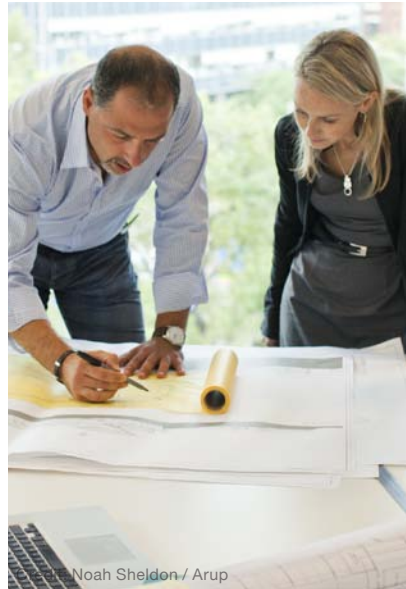
Noah Sheldon / Arup