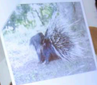
Crested Porcupine Hystrix cristata