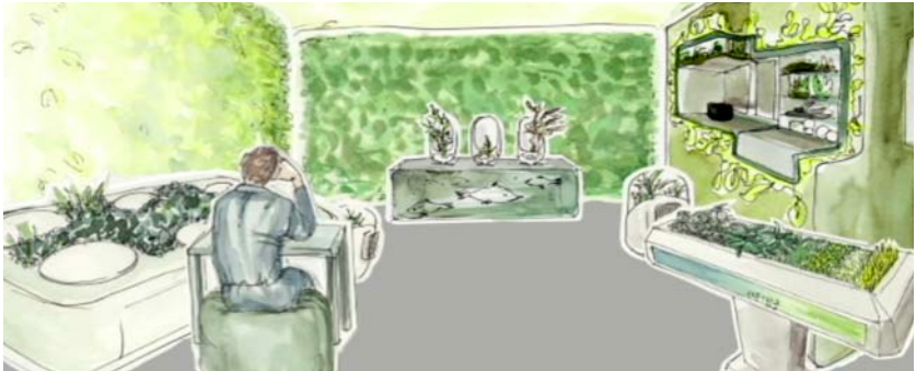
The design of interiors in the future may integrate more 'green' elements, such as plant walls, and functional vegetation that helps to regulate environmental toxins.