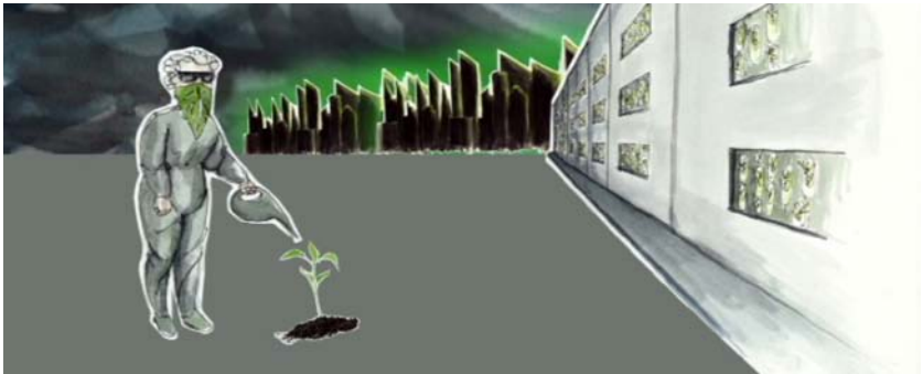
Imagine a world defined by extreme weather and dramatic climate change. In this future, Kew Gardens with its dual role as research centre and visitor attraction, will be a driving force in the development of functional plants.