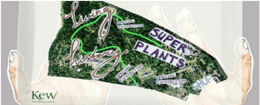
The museum's digital interface aids in curating individual experiences for the user, keeping logs of past visits, in addition to monitoring and sending alerts to regulate carbon emissions per household.